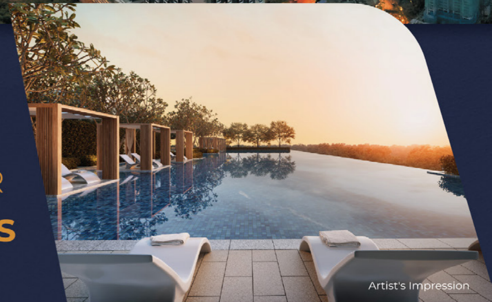
Olympic-length Swimming Pool with Infinity Edge